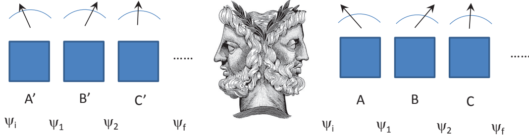
FIGURE 2. The forward and backward Janus sequences: Starting from an initial state, a forward Janus sequence of generalized measurements A, B, C, \dots creates a time-sequence of quantum states, ending with a final state. A backward Janus sequence starts with the final states, and applies a generalized measurement sequence \dots, C', B', A' to “rewind” the movie. The state now starts in the previous final state, and a sequence of measurements creates the time-reversed sequence of state disturbances.

We can find the condition for this to happen by inserting \mathbf{1} = \Theta^{-1}\Theta between every pair of operators, to find in addition to the usual time-reversal invariance of the Hamiltonian, the condition