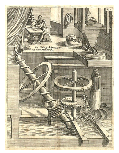
Figure 1. Perpetuum Mobile Mühle. Water drops and drives a rotor to mill grains. The amount of water dropping is supposed to provide enough energy to lift the same amount of water back up and mill the seeds at the same time. It is in violation with the first law of thermodynamics.

Universality of Conservation Laws . Although the conservation laws of physics have certainly been accepted in biology, the conservation of momentum is so far entirely absent in most author's minds. A glance into the most common textbooks of today's biology (Alberts et al., 1994), biochemistry (Berg et al., 2015), physiology (Guyton & Hall, 2006) or more specific literature on neurophysiology (Kandel et al., 2012) or biological signaling (Kim et al., 2015) shall suffice here as a simple demonstration. All of these books mention, in one form or another, " the conservation of energy " multiple times, but not a single one has mentioned momentum conservation even once . This is not a simple peculiarity of textbooks who are usually not designed to discuss controversies in the field. Rather, it exemplifies what is true for nearly all modern models of biological signaling or communication: they suffer – presumably unknowingly – from the violation of momentum conservation and the consequences of this violation can hardly be overestimated .